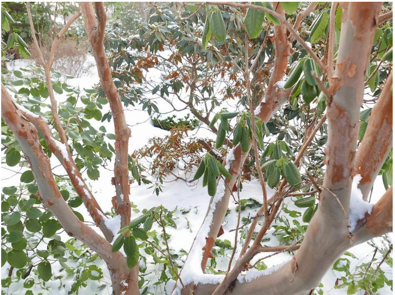
The beautiful bark is one just of the decorative features of this large Rhododendron thomsonii . Above my head it is covered with fat flower buds that will not need much of a rise in temperatures to encourage them to open.