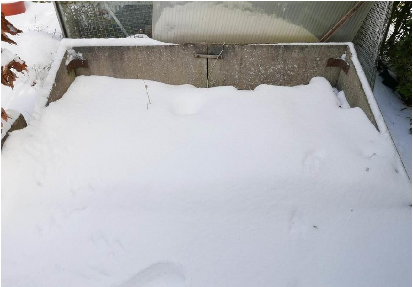
Snow is the ideal cover for the pots in this frame: the white blanket serves to insulate them from the worst effect of the deep frosts, down to -14^{\circ}\text{C} , that we recorded in the garden - 60 miles west in Braemar it was -23^{\circ}\text{C} .