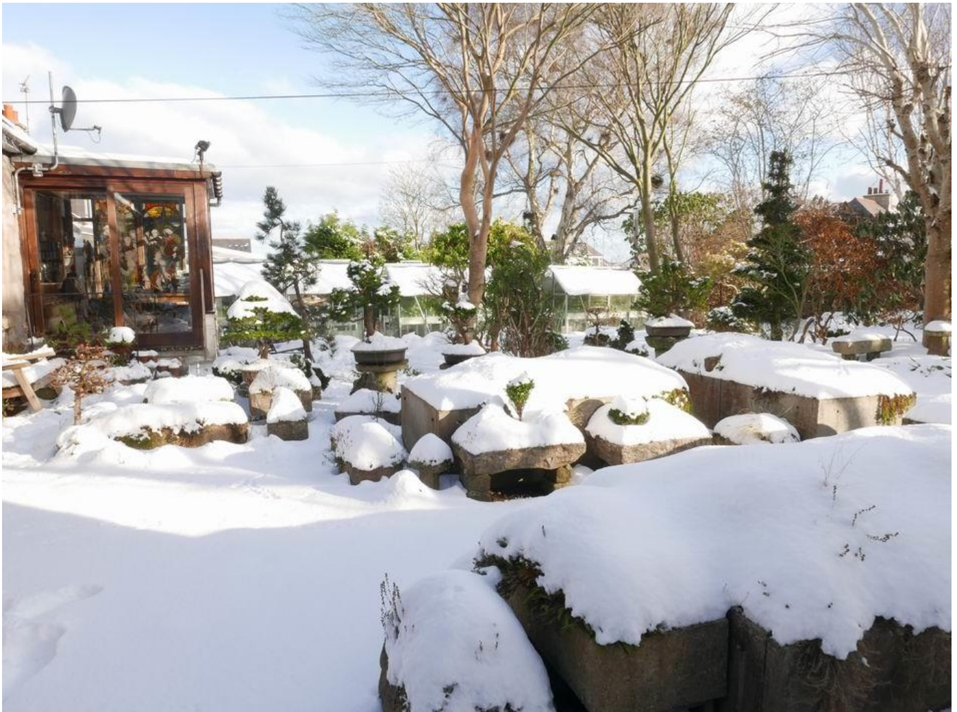
Blue sky, sunshine and snow over the troughs and slab beds makes for an attractive if wintery scene.