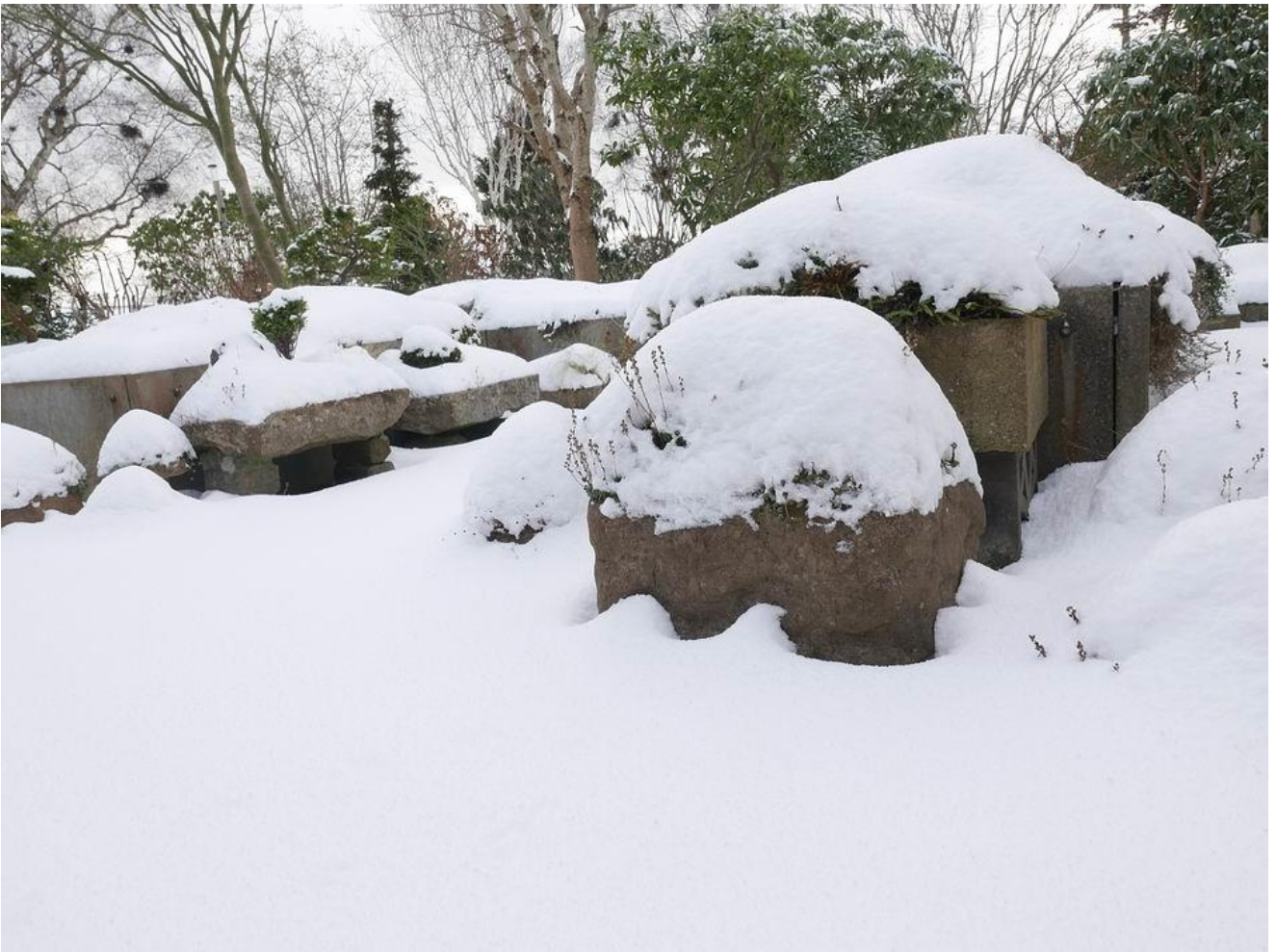
Snow mounds up on the troughs.