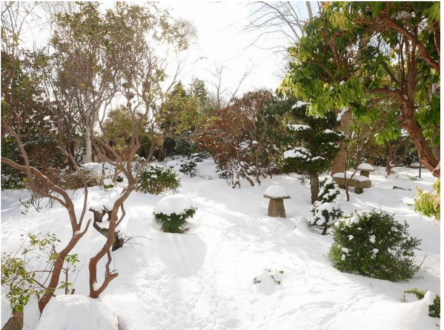
In the brighter moments the greens stand out against the whiteness of the snow.