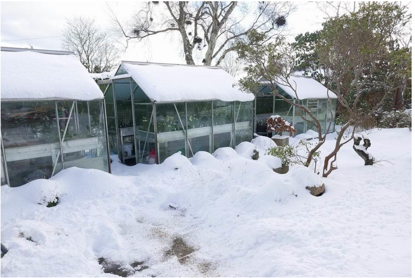
Bulb houses with ever more snow.