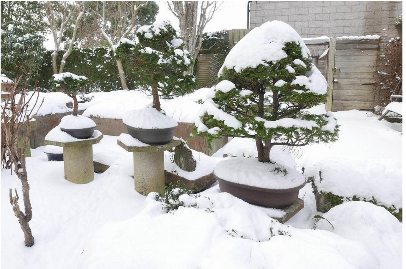
Snow covered bonsai trees.