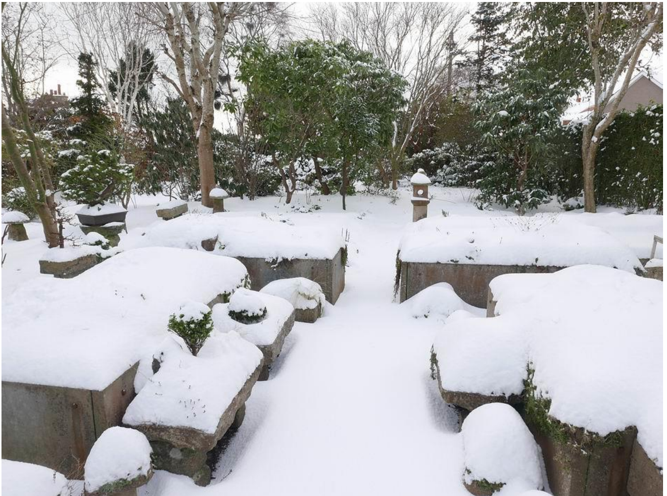
View across the slab beds and trough area towards the rest of the garden.