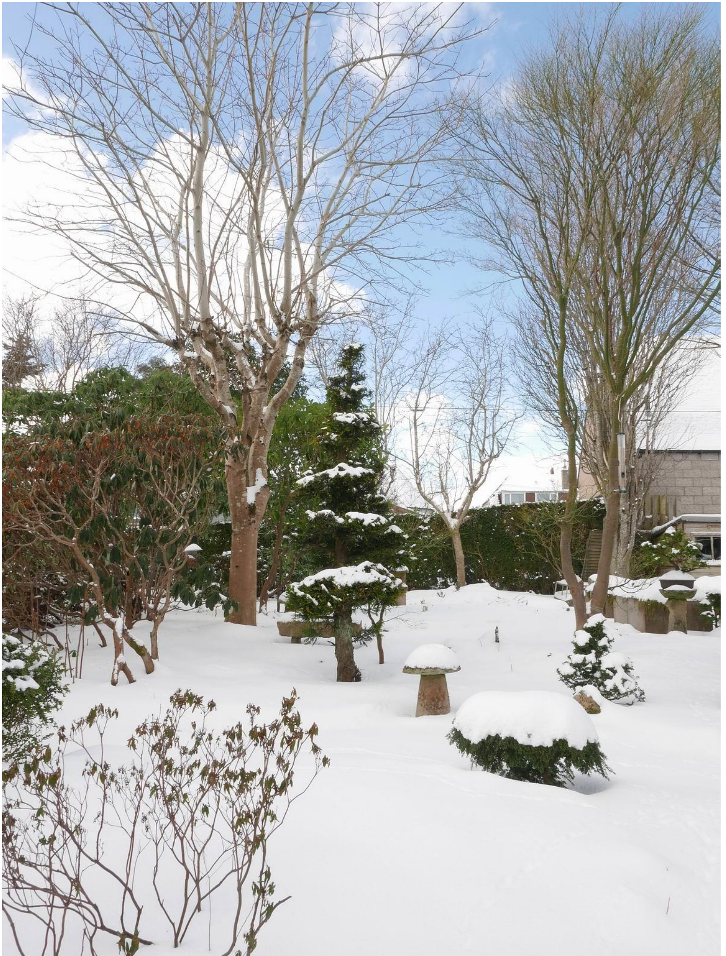
In Scotland we have more than 400 words and expressions for snow, according to a project to compile a Scots thesaurus. Academics have officially logged 421 terms - including "snaw" (snow), "sneel" (to begin to rain or snow) and "skelf" (a large snowflake).....