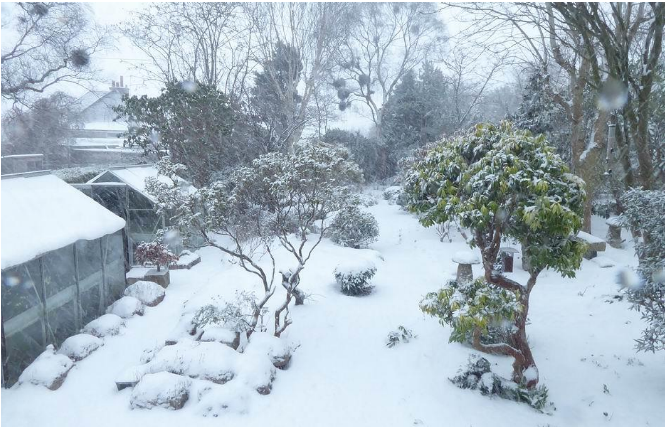
Like many others we were hit by winter this week - starting last Wednesday as I loaded the Bulb Log heavy snow was falling - quickly covering the garden in a deepening white blanket.