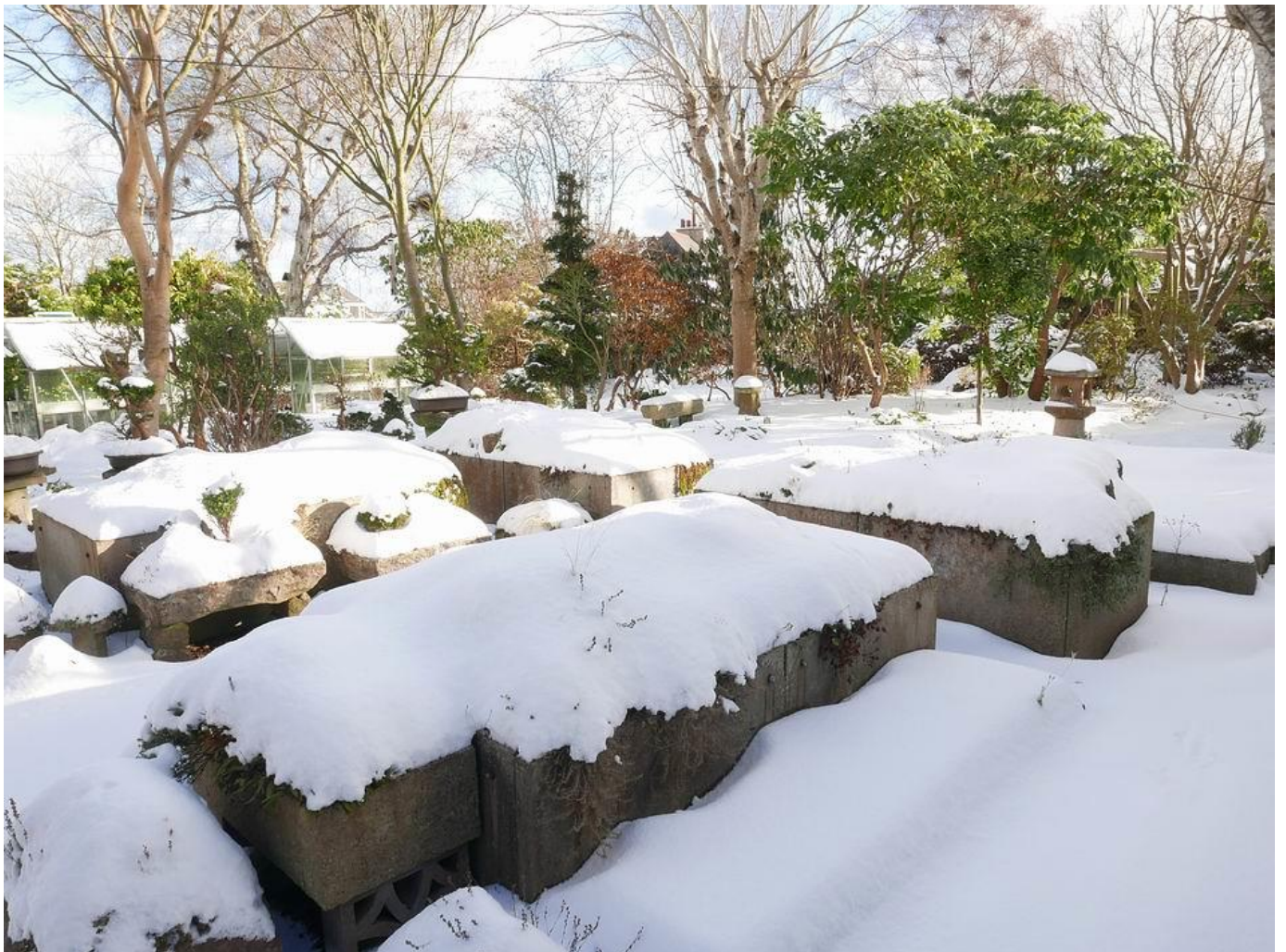
When the snow stopped we got a brief period with blue sky and sunshine before more showers came in.