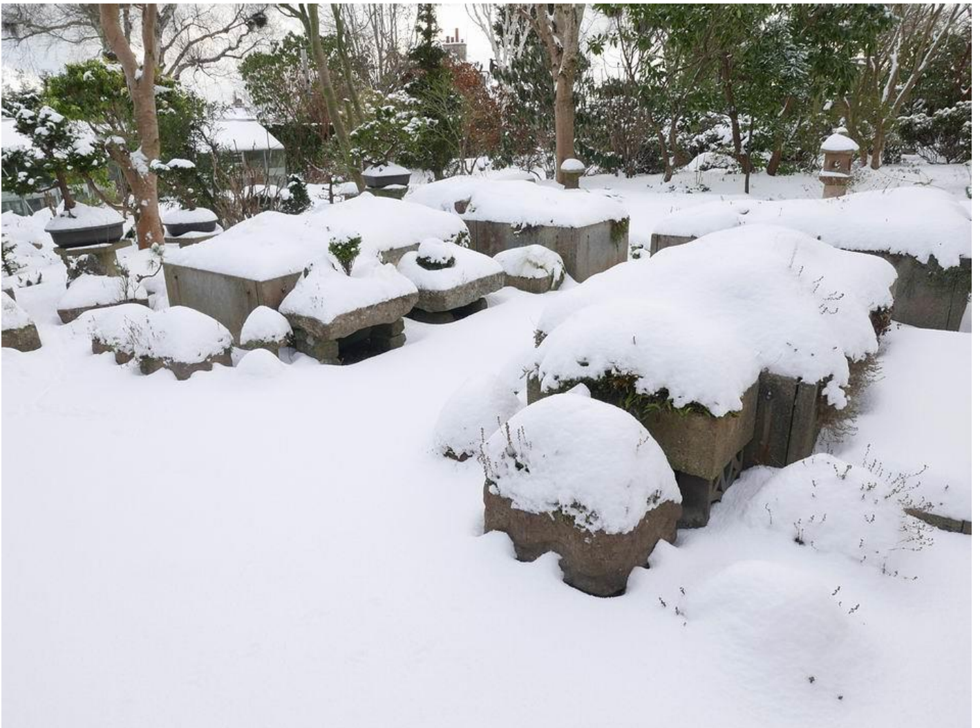
A few weeks ago I showed how a light dusting of snow made the rock landscapes in the troughs and slab beds more dramatic in appearance now they are disappearing under mounds of snow but still they look attractive.