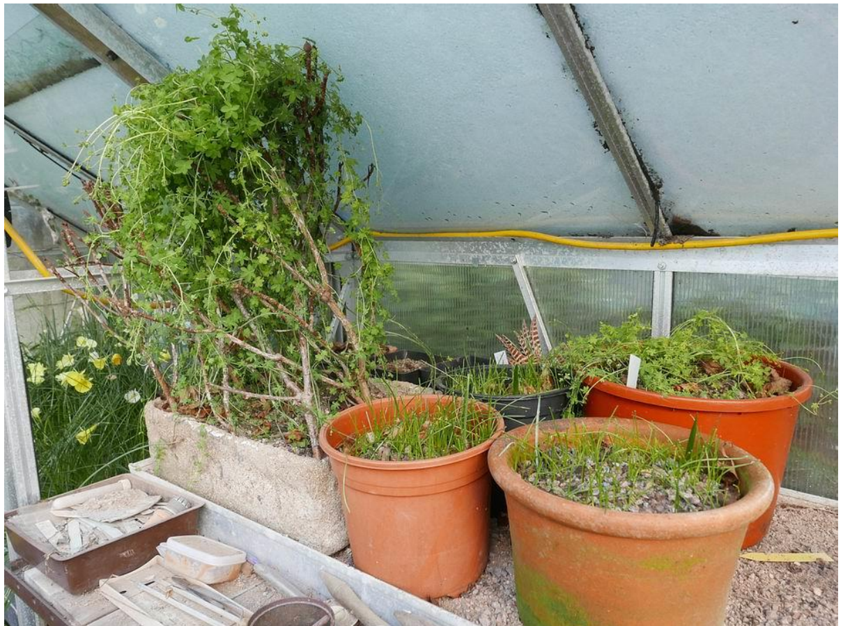
Tropaeolum tricolor and mixed Narcissus

There are some overflow plants and seedlings in pots and a small sand bed in this bulb house that were not protected by a cable so I am interested to see if they have been damaged. These include Tropaeolum tricolor and I know the foliage is frost hardy down to these levels but it will be interesting to see how the tubers, which were on the dry side, survive. I also have another pot of this I forgot about sitting exposed outside so I can do a direct comparison.