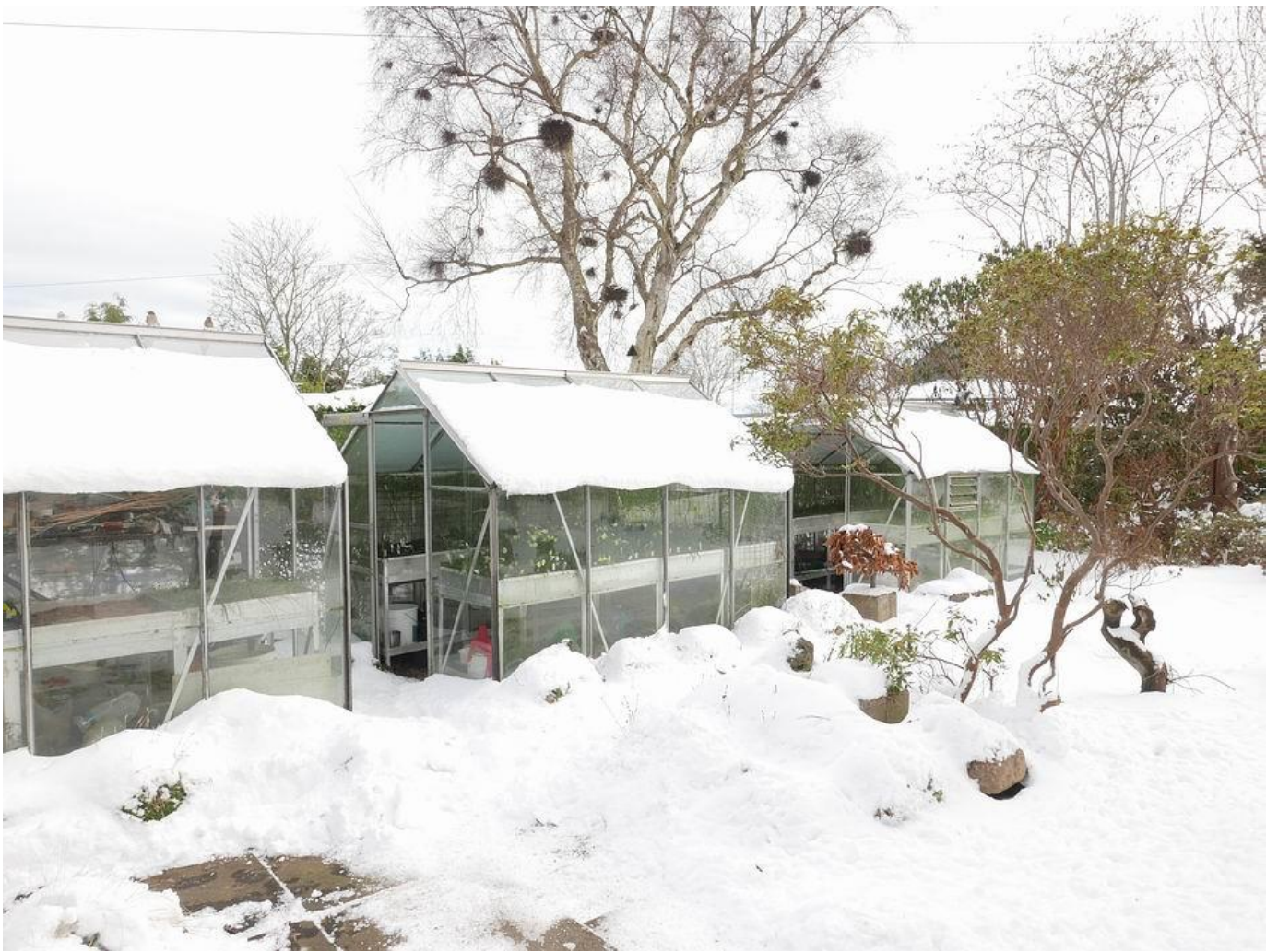
As the snow got deeper and the worst of the cold was moving away it was time to clear the bulb house roofs.