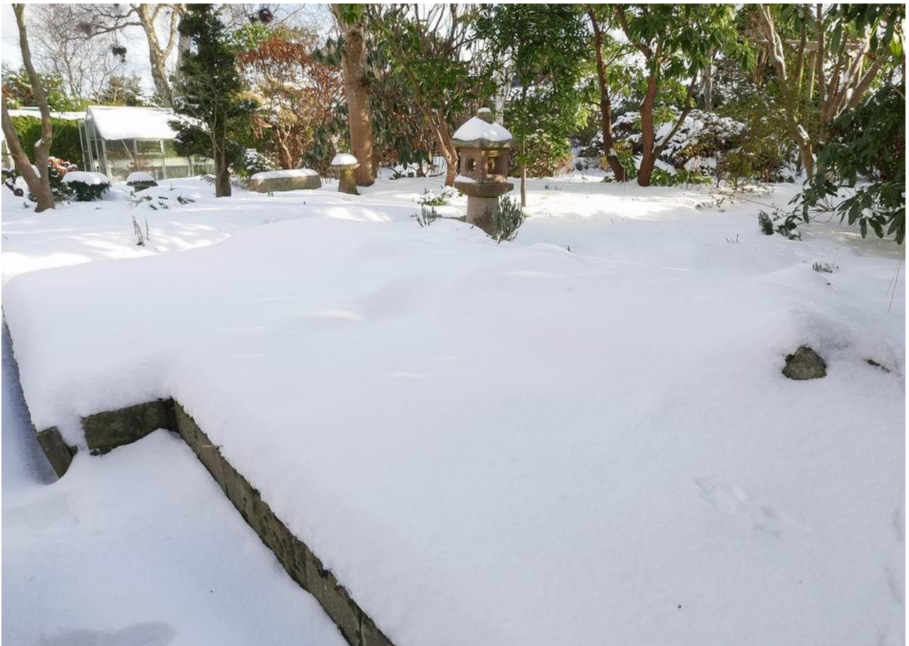
The Erythronium plunge has become a white canvas; a nice contrast to the riot of colour that will be on display in a few months' time.