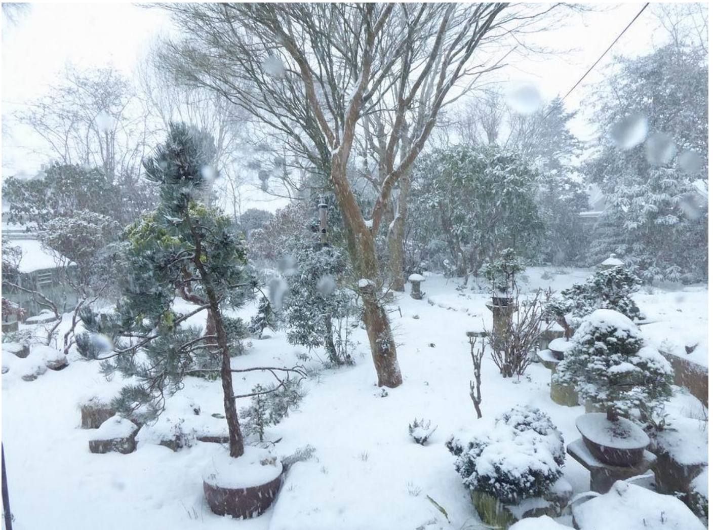
I tried capturing the snow fall through the windows in these first three pictures as it was too wild to venture out.