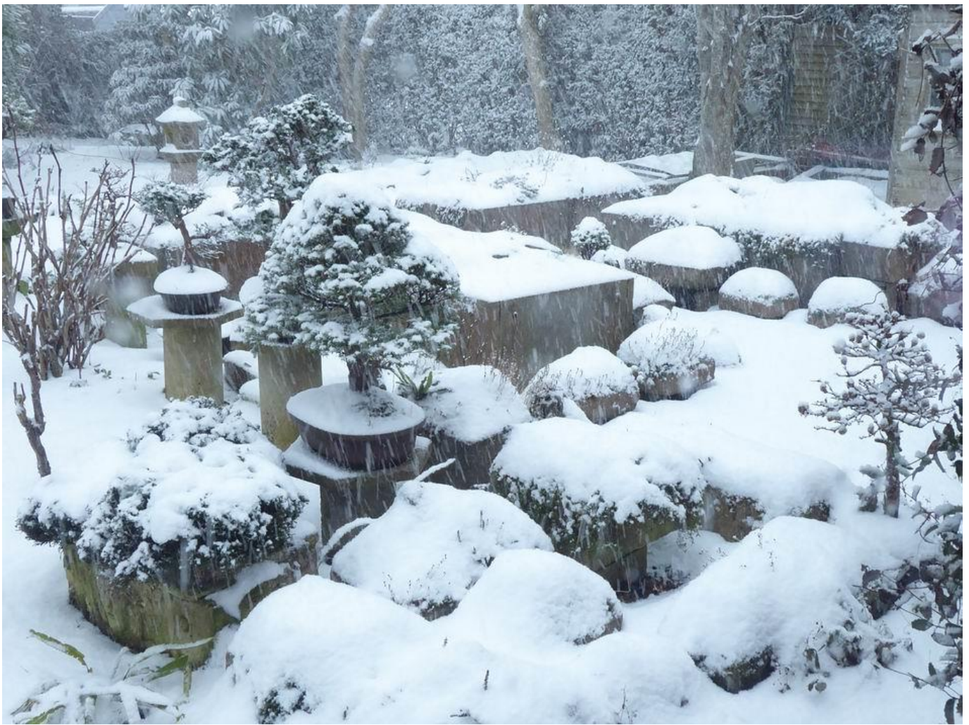
Well landscaped troughs, built up well above the rim with large rocks, look much more attractive even when covered in snow.

The snow came in waves, blowing in from the east on strong winds and during the breaks between snow I went out to take some pictures. The pictures appear this week in chronological order showing the deepening snow levels building up over a couple of days of snow storms.